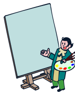
Art and Cartoony